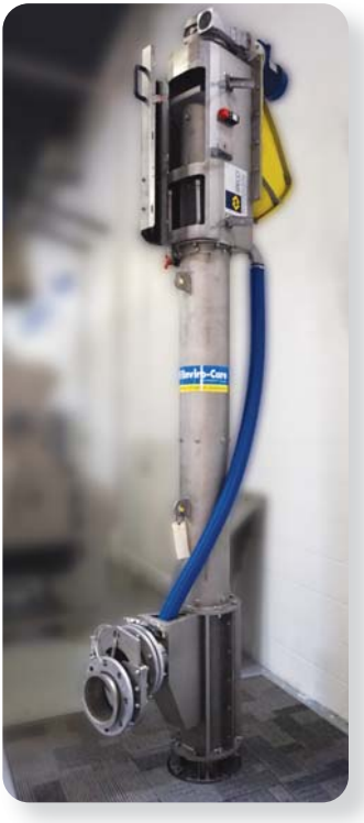
GCV Unit from WEFTEC 2015