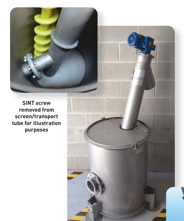
Mini Screw Screen in a Tank